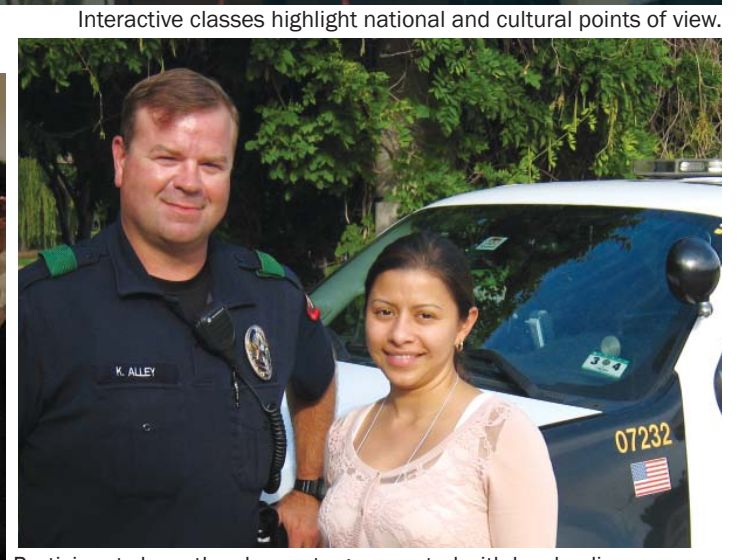
Participants have the chance to go on patrol with local police.