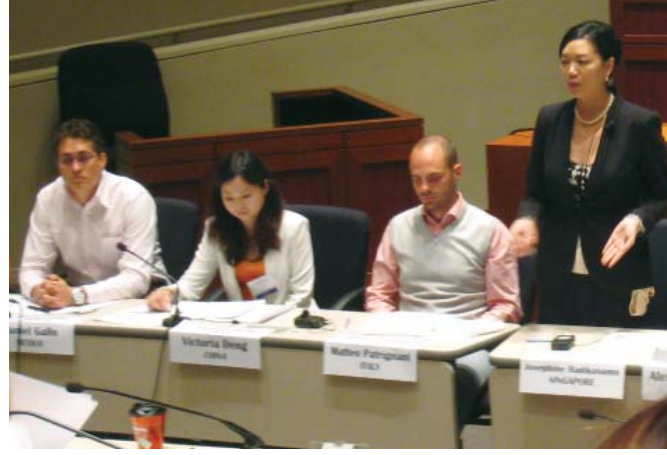
Participants tackle a practical international compliance problem.