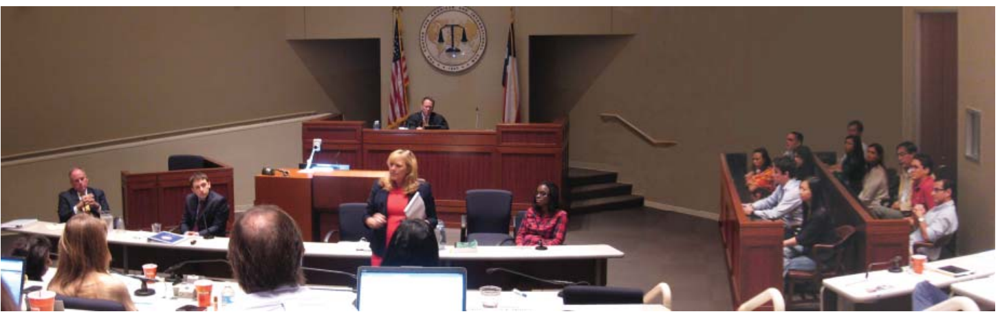
Academy participants take part in a mock civil trial, serving as plaintiff, defendant, jurors, and witnesses.