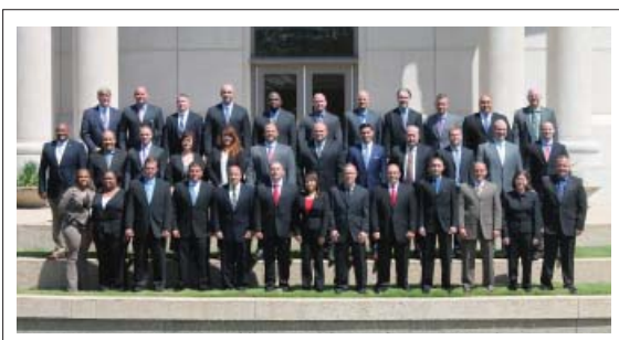
119th School of Police Supervision

$1,475/$1,575* ILEA Member/Non-member for Plano and Fort Worth Schools