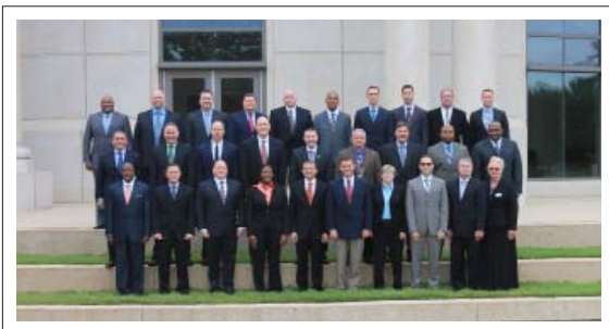
53rd School of Executive Leadership

This course is designed for first-line supervisors and middle-level management and should be of interest to all law enforcement agencies concerned with the professionalism of their management team.