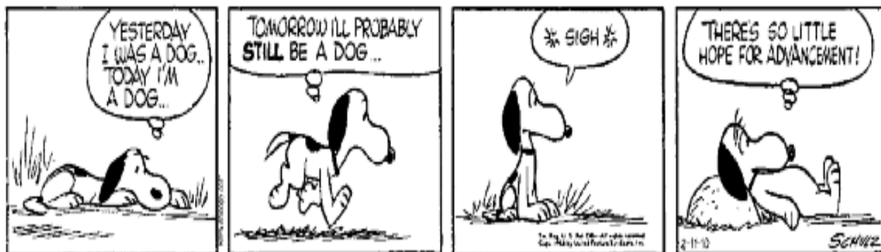
PEANUTS: ©United Feature Syndicate, Inc.

This conference provides 14 hours of TCLEOSE credit for law enforcement officers from the State of Texas.