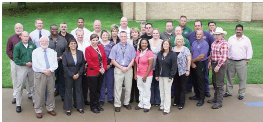
Ethics Train-the-Trainer in Corrections first graduating class held at the Tarrant County Sheriff's Academy in Fort Worth August 17-21, 2009.