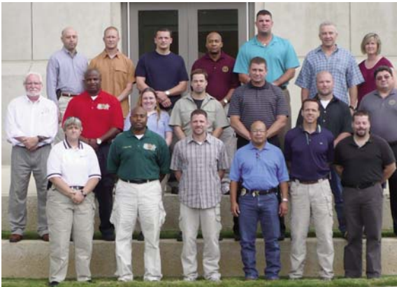
Ethics Train-the-Trainer class conducted September 16-18, 2009, at Institute headquarters.

Then we see that The Commission on Public Integrity (CPI), the State of New York’s watchdog panel decided just recently that “no one would be given a failing grade on the [online ethics] test.” i The story there goes that this decision to fail no one was made “after a bug in the system was found to be handing out failing grades to anyone who got less than a perfect score.” ii The plot sickens when we read that state employees are not required to take the test, nor is there any real incentive to do so. No one was penalized for failing it and the CPI revised the online exam to give you the right answer if you gave the wrong one, whereas the older version with the “bugs” only told you if you had the answer right or wrong. Again, whether this is a deliberate “dumbing-down” of what appears to be an important examination, I cannot say.