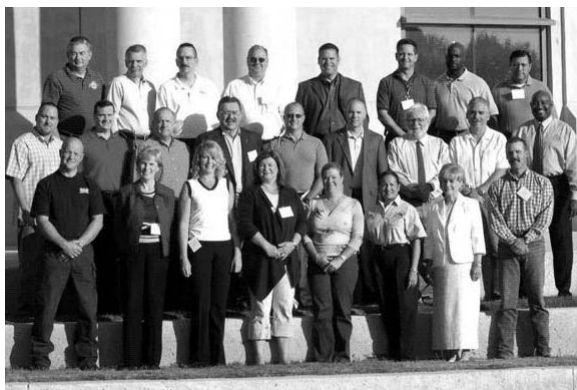
Participants of the September 11-15, 2006 Ethics Train-the-Trainer class held at the Institute for Law Enforcement Administration headquarters in Plano, Texas.

When it comes to apologies, the British novelist Orzcy Emmuska said this: "An apology? Bah! Disgusting! Cowardly! Beneath the dignity of any gentleman, however wrong he might be." On the other hand, Lynn Johnston, creator of the comic strip "For Better or Worse" put it this way: "An apology is the superglue of life. It can repair just about anything."