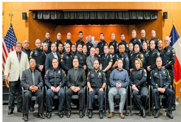
Graduates of the Texas Sergeant Academy hosted by San Marcos Police Department May 6-17, 2019.