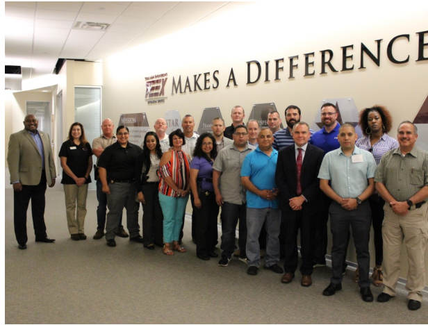
Class photo of participants in Internal Affairs and Professional Standards, which was hosted by TEEX in College Station, TX

and Vice President of the Center for American and International Law. “We both focus on serving the law enforcement community and this partnership will be extremely powerful and has great potential for growth. ILEA is uniquely positioned to provide continuing education for leaders, supervisors and administrators in law enforcement. This agreement allows TEEX to expand their reach in that arena, and allows us to reach new markets and a broader audience for our services.”