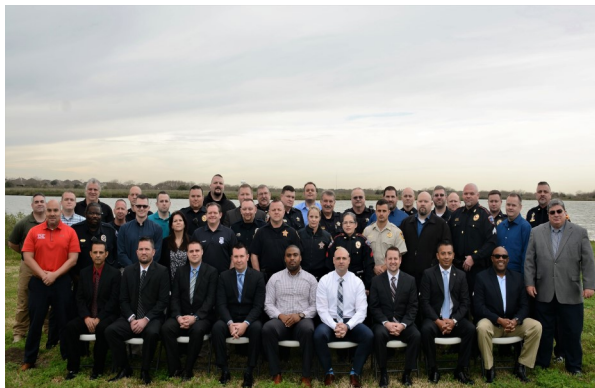
Graduates of the Texas Sergeant Academy hosted by Texas City Police Department February 4-15, 2019.